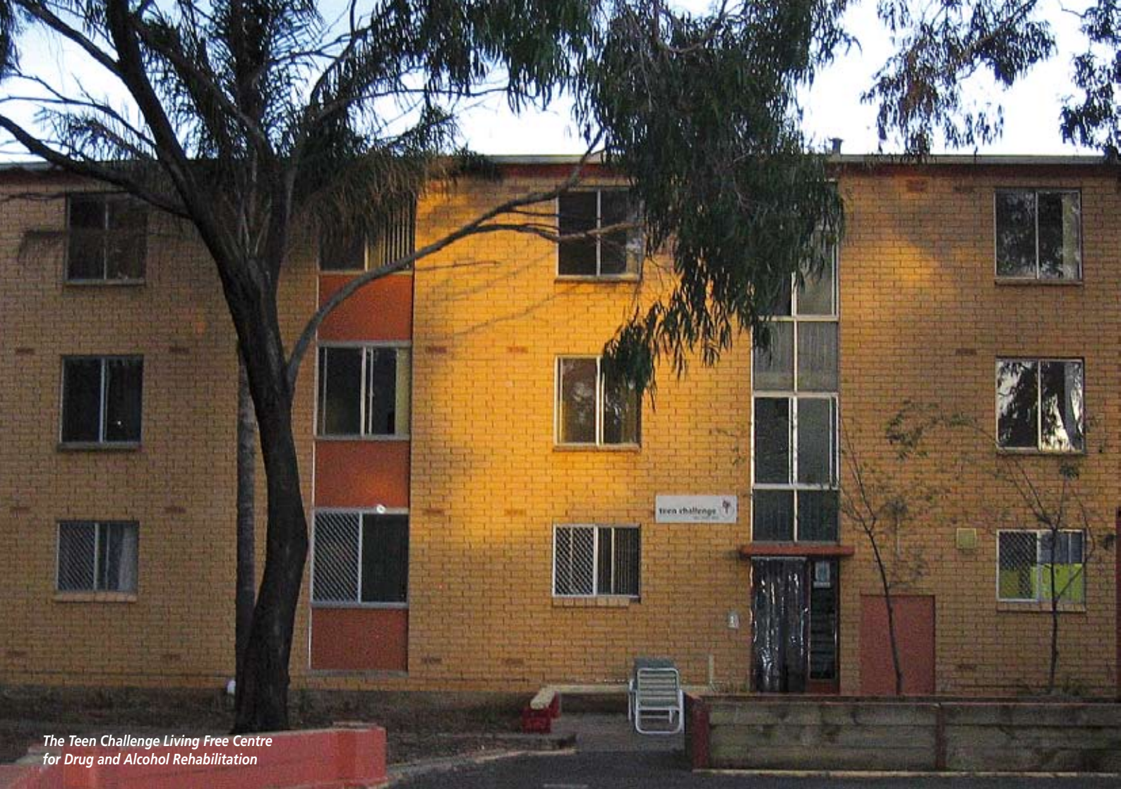
The Teen Challenge Living Free Centre for Drug and Alcohol Rehabilitation